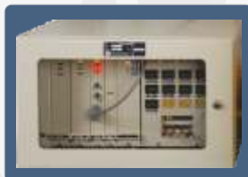
Counter Box to record emergency cancellations done manually