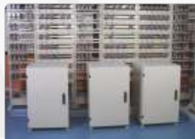
Yard Signaling Control Room (at station)