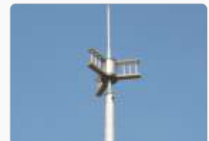
Lightning Arrester ESE Type