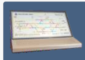
Simulator Panel for Route Setting (lab model for testing)